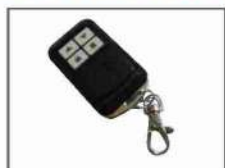
AZ BLDCTX22 Transmitter