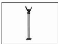
AZ BB VH V Holder