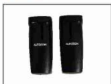
AZ PC 10 Photocell