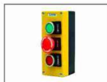
AZ PB 16 A Push Button