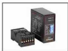
AZ LB 33 Loop Detector