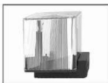
AZ FL 19 Flash Lamp