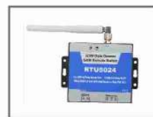
AZ GSM 30 GSM Module