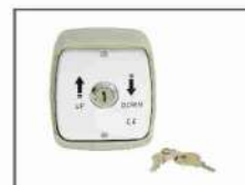
AZ KS 15 Key Switch