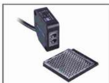
AZ RFPC 417M IP Reflector Photocell