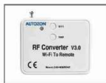
AZ RF WIFI 31A Wifi Module